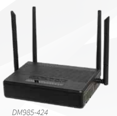
# NN ---- 1 : #