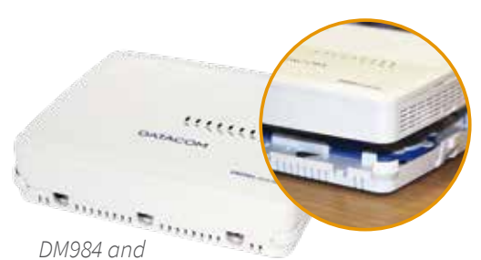
its integrated OFE

■ Laser type B+ or C+ (DM984-100B model), according to ITU-T G.984.2 Amd.1